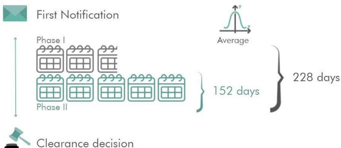
Figure 3: The average duration of Phase II reviews

When a transaction is taken through to Phase II, a long waiting period begins for the merging parties. The average length of Phase II review in 25 years is 152 days. If we calculate from the date of the first notification, a transaction under Phase II review was concluded at the end of 228 days on average.