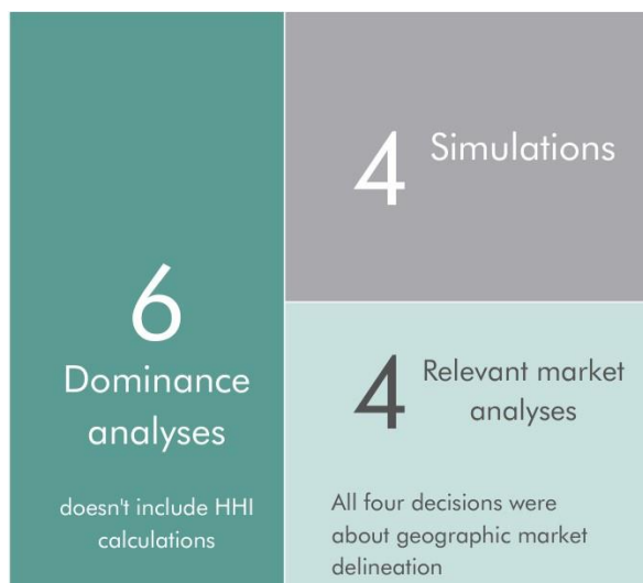
Figure 6: Complex economic analysis in TCA's Phase II cases.

Defining the markets is one of the critical challenges the merging parties face during the reviews. A broader definition of the market dilutes the market power of the merged identity and eases TCA's competitive concerns. TCA conducted sophisticated geographic market delineations during its Phase II reviews using quantitative techniques in four cases. Interestingly, a quantitative study on the relevant product market analysis has yet to be conducted in a Phase II case.